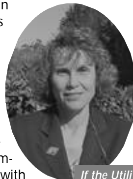
If the Utility tax is repealed, Sharon's position will be cut in half.

The MHRC is located in the same building that is home to Community Connections at the end of Encinal Street adjacent to Harvey West Park. The center provides education "Journey of Hope" classes for consumers and families; it also has a library with excellent videos (see page 6), books, and much more. ☎